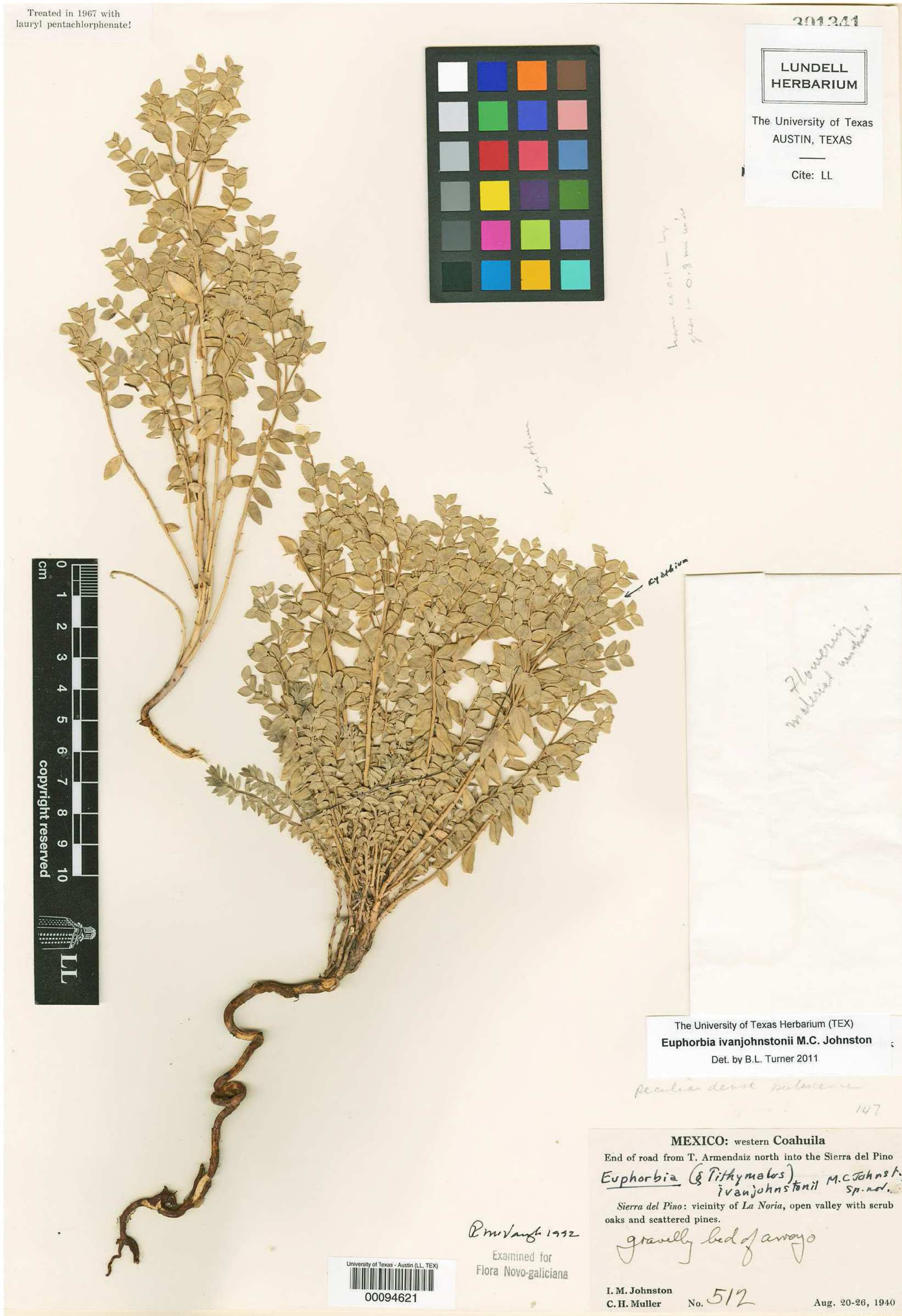
Figure 3. Euphorbia ivanjohnstonii (typical form).